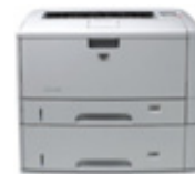
HP LaserJet 5200dtn printer