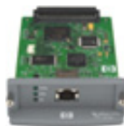
HP Jetdirect internal print server

Print professional documents and save time with the automatic two-sided printing unit (standard on the 5200dtn model).